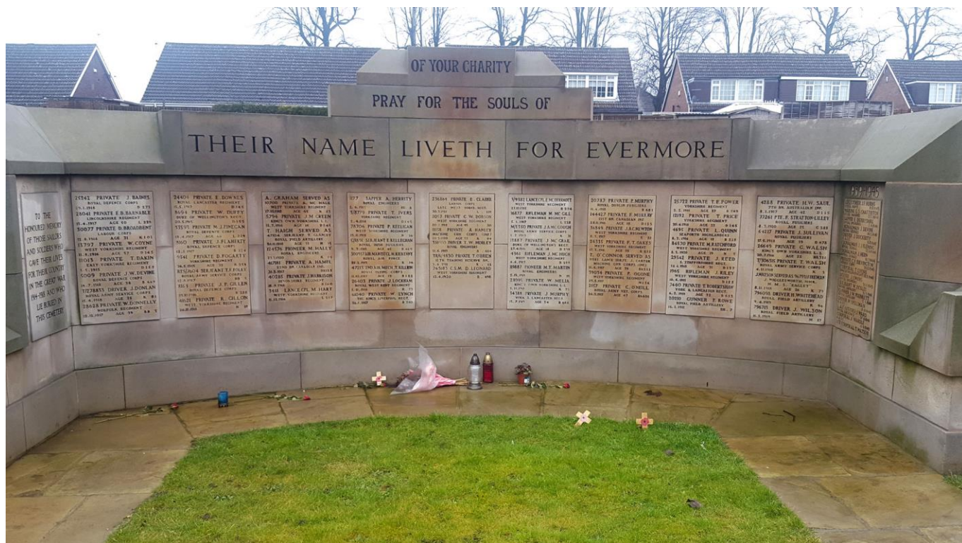
CWGC Screen wall

Private H. W. Saul is named on the Commonwealth War Graves Commission's Screen Wall in Killingbeck Cemetery, Leeds (also known as Leeds Roman Catholic Cemetery), Yorkshire, England